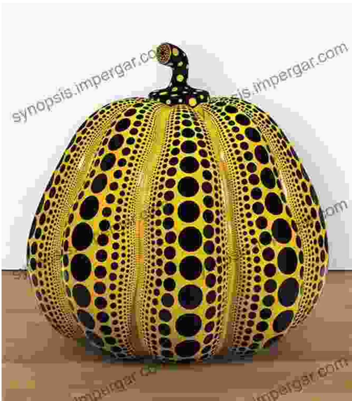
Yayoi Kusama, The Yell of the Naked Soul , 2010

Yayoi Kusama is a true pioneer of modern art. Her work has influenced generations of artists, and it continues to inspire and challenge viewers today. Modern Art Asia Issue Yayoi Kusama is a must-have for anyone interested in the work of this extraordinary artist.