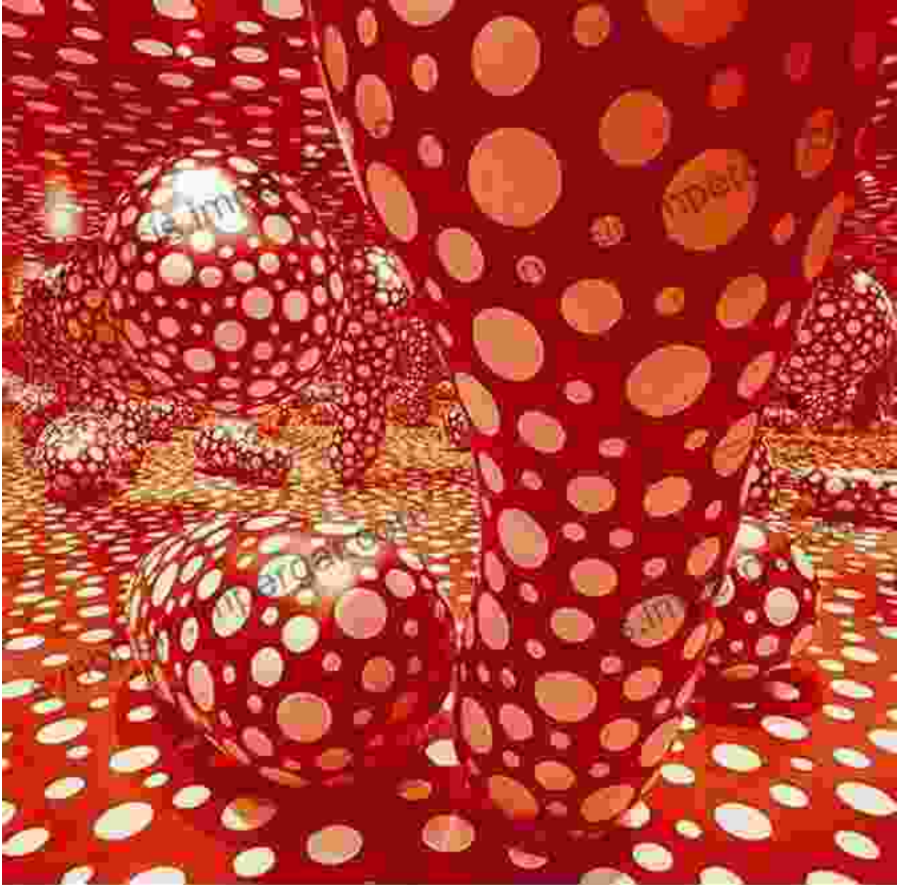
Yayoi Kusama, Polka Dot Dress , 1964

Kusama's infinity mirrors are another one of her signature works. These installations consist of a room lined with mirrors and filled with hundreds of small lights. The lights create an infinite reflection, which makes the viewer feel like they are lost in a never-ending space.