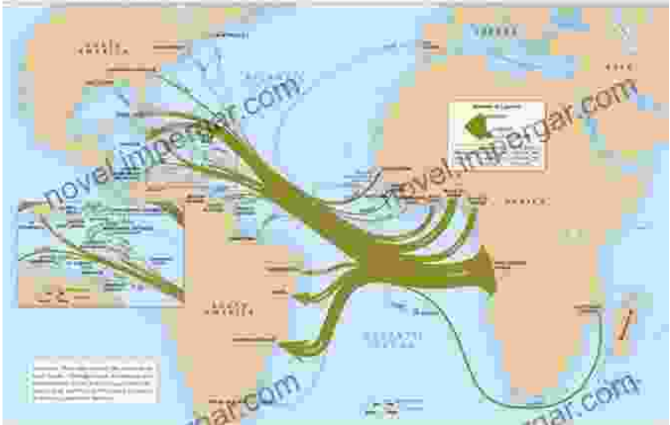
Map 11: Overview of the Transatlantic Slave Trade, 1482-1867

The transatlantic slave trade forcibly transported millions of people from Africa to the Americas.