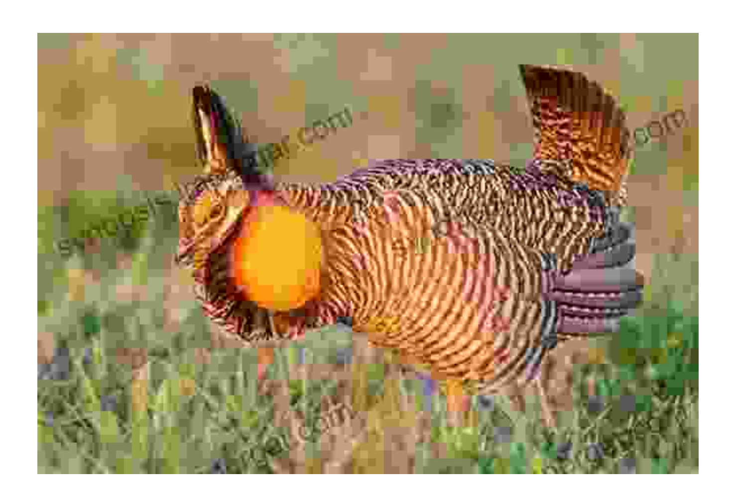
Chapter 4: Endemic and Rare Jewels

insects at night. 4. Golden-fronted Woodpecker: Look for its golden forehead and bright red nape. 5. Greater Roadrunner: Its long tail and distinctive "beep-beep" call make it a beloved desert icon. 6. Least Tern: Its small size and pale plumage make it easy to spot along the coast. 7. Piping Plover: Its delicate appearance and habit of nesting on sandy beaches require careful observation. 8. Redhead: This striking redhead is a common sight on Texas lakes and ponds. 9. Vermilion Flycatcher: Its brilliant scarlet plumage makes it a vibrant splash of color in desert scrublands. 10. White-tailed Hawk: Its distinctive white tail and soaring flight pattern are unmistakable.