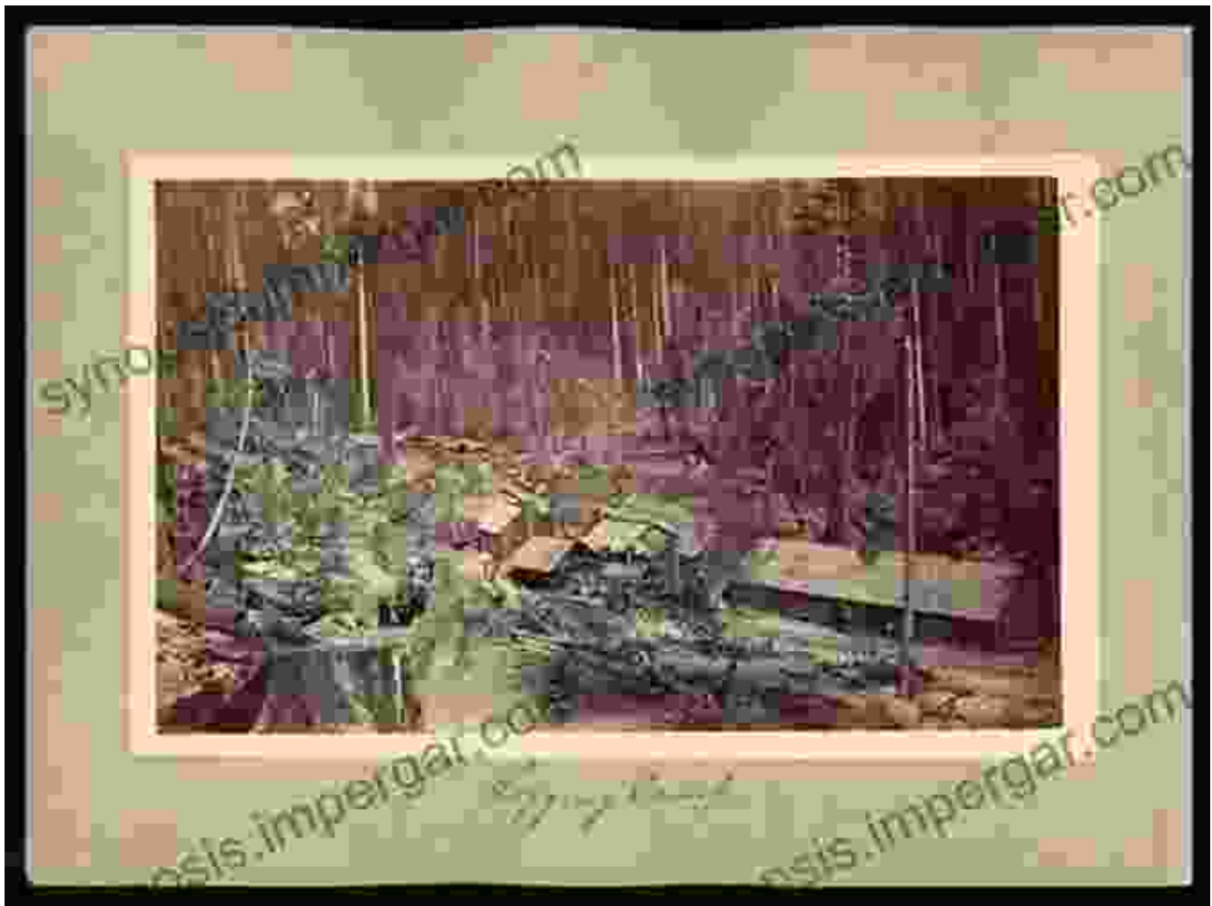
A logging camp in Humboldt County, circa 1900.

Beyond the industrial history, "Mills of Humboldt County" also delves into the human impact of the mills on the lives of the people who lived and worked in them. The book features oral histories, family photographs, and personal anecdotes that shed light on the challenges and triumphs faced by the mill workers, their families, and the surrounding communities.