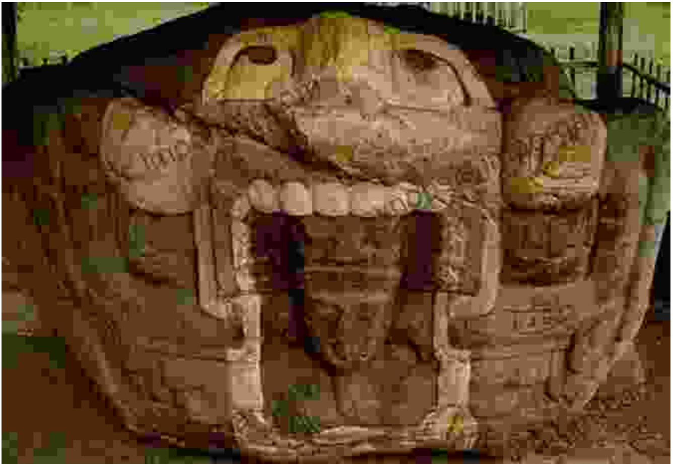
Zoomorph B at Quirigua, depicting a jaguar

Equally impressive are the city's zoomorphs, monumental sculptures carved in the form of animals such as jaguars, turtles, and birds. These enigmatic creatures played a significant role in Maya cosmology and often appear in association with rulers, symbolizing their supernatural power and divine connections.